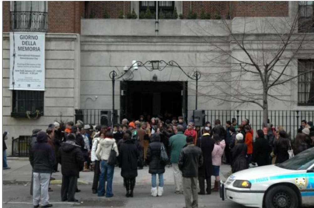
January 27, 2011. Reading on Park Avenue, right outside of the Italian Consulate General and the Italian Cultural Institute

The Consulate General of Italy has once again joined forces with Primo Levi Center, the Italian Cultural Institute, Casa Italiana Zerilli-Marimò at NYU, John D. Calandra Institute at CUNY, Italian Academy at Columbia University, Scuola d’Italia “Guglielmo Marconi”, i-Italy.org and Rai Corporation, and will enrich the traditional ceremony with a new and suggestive feature: the invitation to the public is not just the one to read, but to play music as a counterpoint to the ongoing reading.