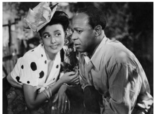
Still from Cabin in the Sky.