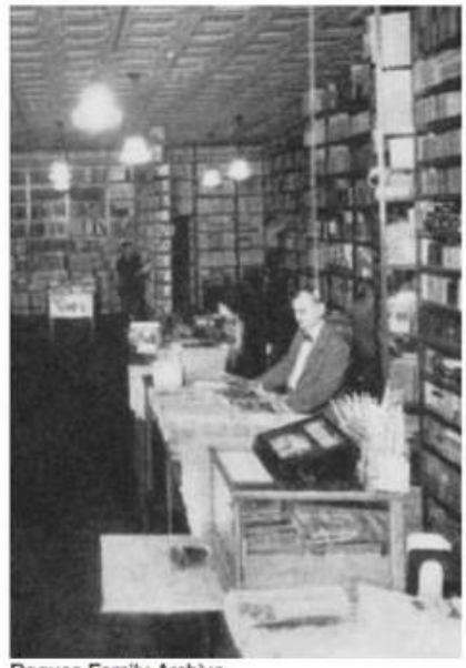
Ragusa Family Archive